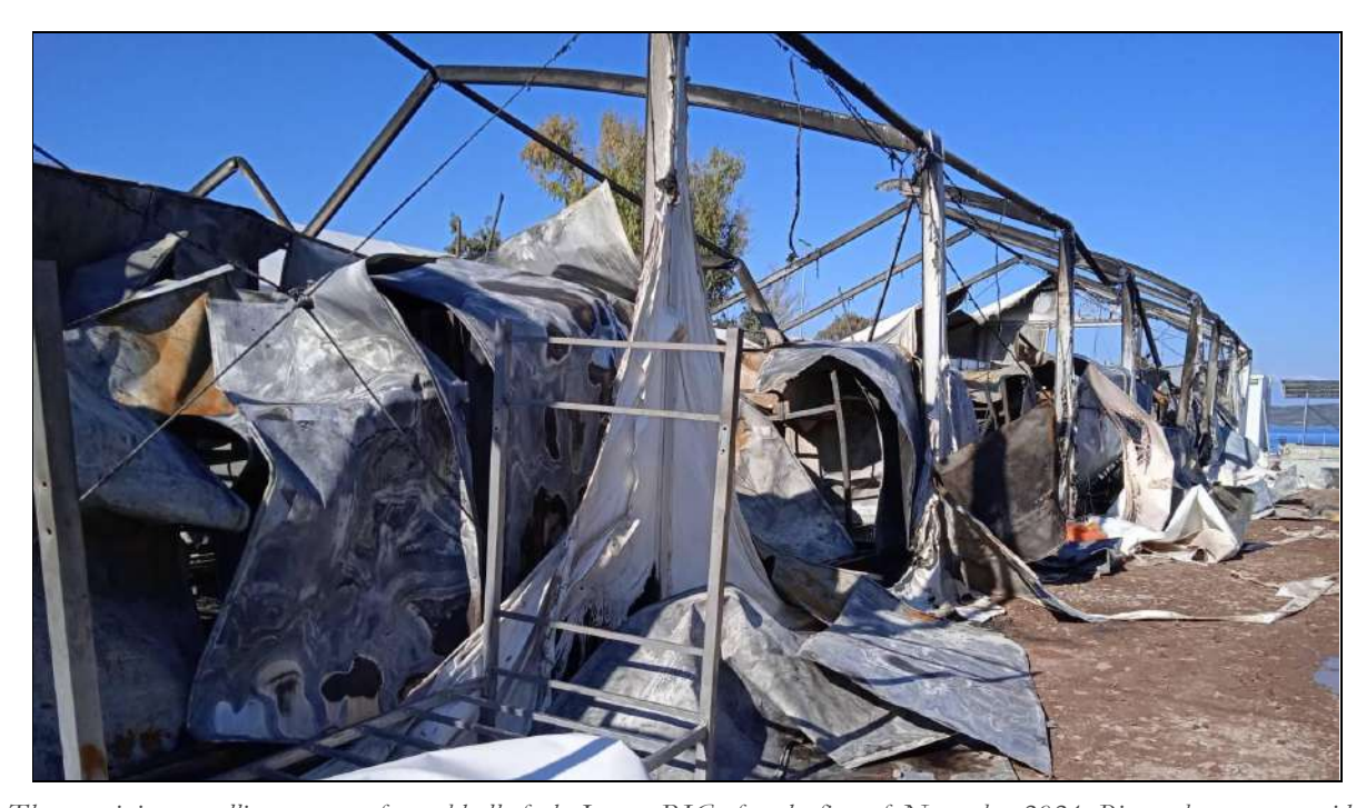
The remaining metallic structure of a rubhall of the Lesvos RIC after the fires of November 2021, Picture by a camp resident.

children's repeated exposure to such dangers has had a deleterious effect on their mental health. These people's repeated exposure to life-threatening fires not only compounds the trauma of each event, but also manifests the Greek government and European Union's fundamental disregard for migrants' lives and safety.