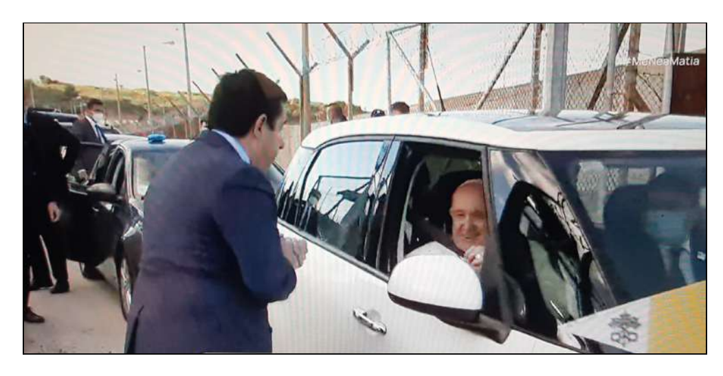
Pope Francis arriving to the Lesvos RIC followed by a dozen of cars where he was welcomed by the Minister of Migration and Asylum, Panagiotis Mitarakis, 5 December 2021

Further details on the Pope's visit in Lesvos are available in the press.