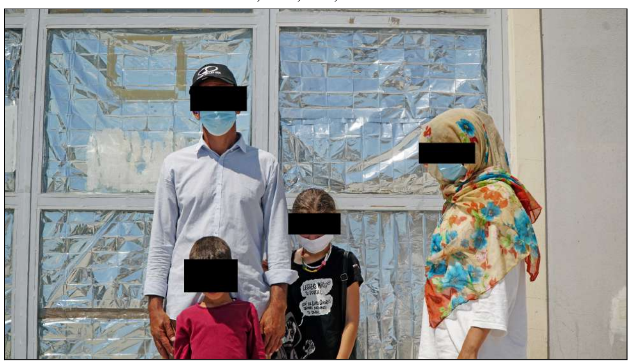
Family of four forced to live with their children in the Lesvos RIC without any financial support since September 2021, Picture: Fellipe Lopes.

This policy follows the decision by the Greek government in March 2021 to automatically discontinue all material reception conditions, including housing, food and cash assistance provided for recognised refugees and beneficiaries of subsidiary protection as soon as their protection status was granted. According to this provision, beneficiaries of protection had to leave government run housing facilities (including camps or State-provided apartments) in the first 30 days after the granting of protection. Following this decision, thousands of recognized refugees found themselves without shelter, living in public squares for prolonged periods of time. Without access to integration support or any viable housing alternative, many were thus compelled to return to camps in order to have access to the bare minimum - that is, water, food, and some form of shelter.