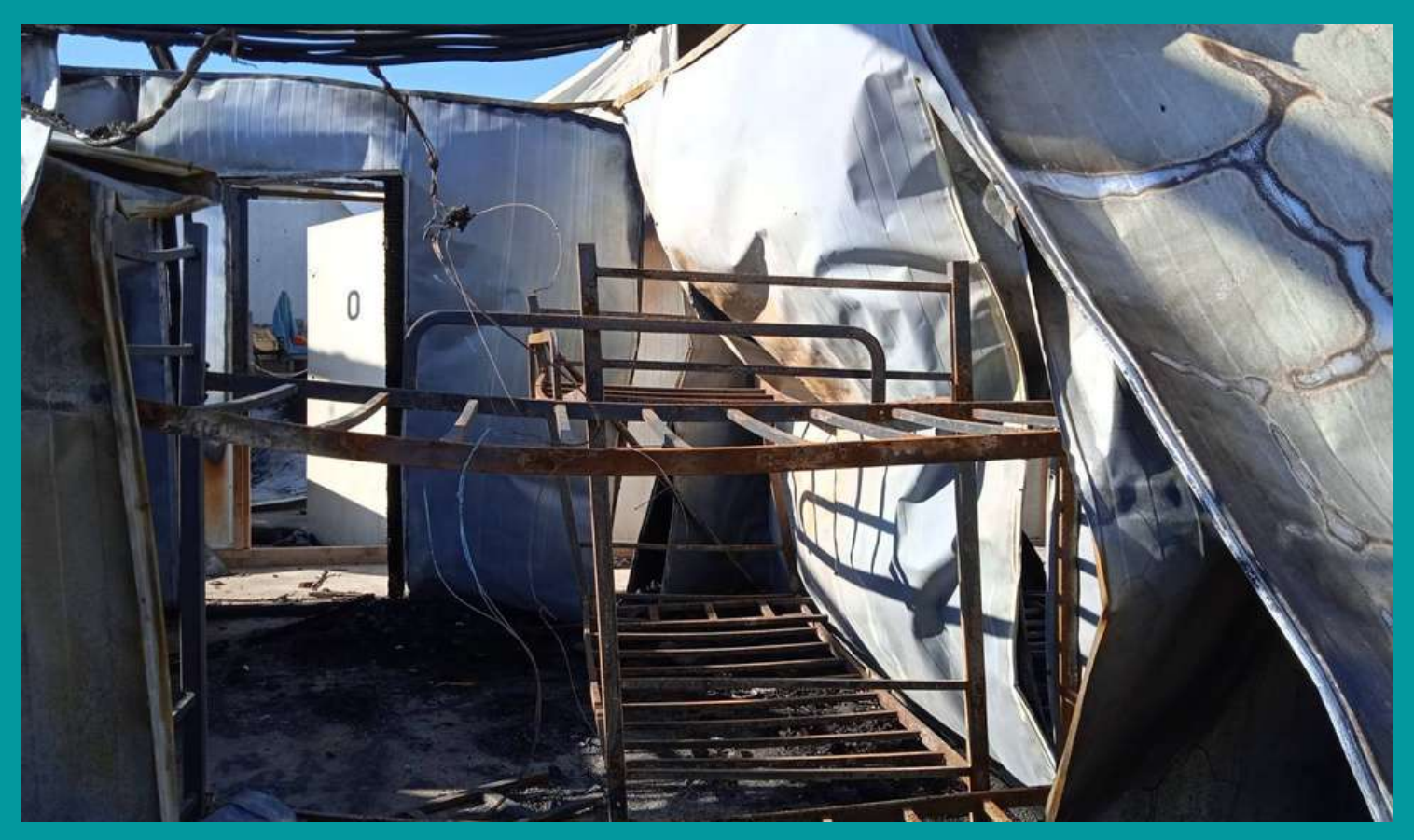
Inside a burnt down rubhall in the Lesvos RIC, which used to host 80 to 100 people and was entirely destroyed after one of the fires that broke out in November 2021.